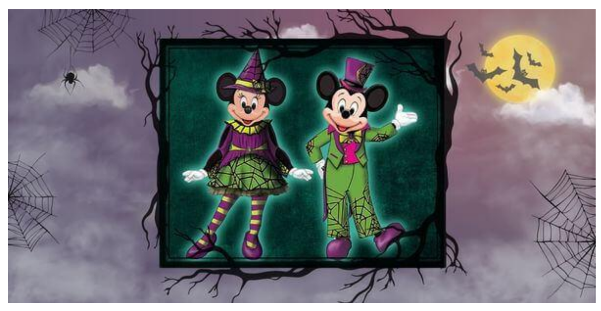
Mickey and Minnie Mouse are the heart and soul of Disney, and their costumes are always a highlight of the Not So Scary Halloween Party.

This year, their costumes are more enchanting than ever! Mickey is dressed in a vibrant green suit adorned with spider web patterns, complemented by a purple bow tie and top hat, adding a spooky yet stylish touch. Minnie, on the other hand, is charming everyone in her elegant witch outfit, featuring a vibrant purple dress with green and black spider web accents, complete with a witch hat and striped stockings.